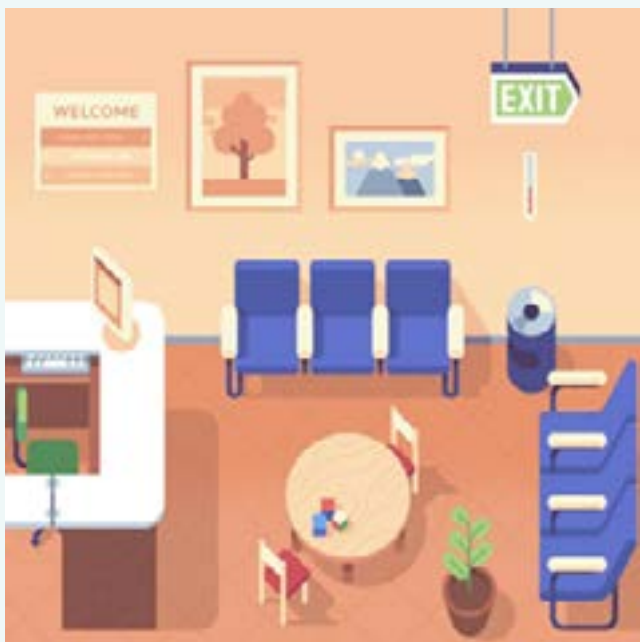
Room 1 Non-trauma-informed space

Room 2 Trauma-informed space: Has clearly marked exit sign, light painted walls, children's table and plants.